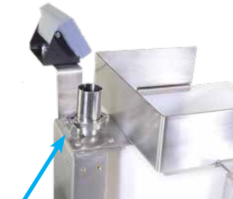
Quick clamp hose connection.

Scale hopper for conveying blends to roasters or blenders.