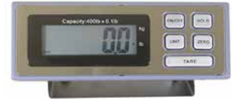
Accurate control that is easy to use. Just press the tare button before you add each component.